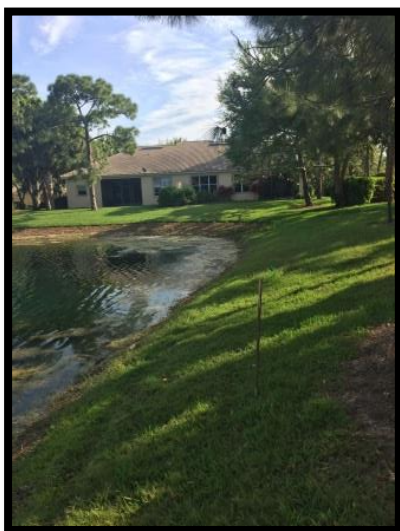
Figure 2: Picture to the right depicts a floating island installed recently in the effluent lake (on the left as you pass thru the main gate to the community).

A few questions that have come up: 1) When will the plantings be completed? Littoral plants will not be placed til the beginning of the rainy season. The upland and rough areas will be sprayed and planted in the coming weeks. 2) Why are the sprinklers spraying the lake banks? During the dry season, supplemental watering of the lake banks is needed to keep the plantings alive. Stahlman has adjusted the sprinkler heads and changed spray nozzles with greater capacity due to the increased spray pattern. The water will spray over the lakes in the wet season as well when the water level are up. 3) What do I do if I have other concerns, or questions about the work being done? Please contact our Property Manager Tony McHugh at 596-9634, or tmchugh@resortgroupinc.com to answer any questions, or concerns that you may have.